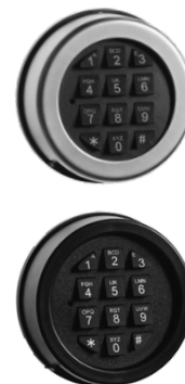
Keypads AL2020 & AL2030