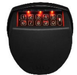
Keypads PI2030 & QT2030